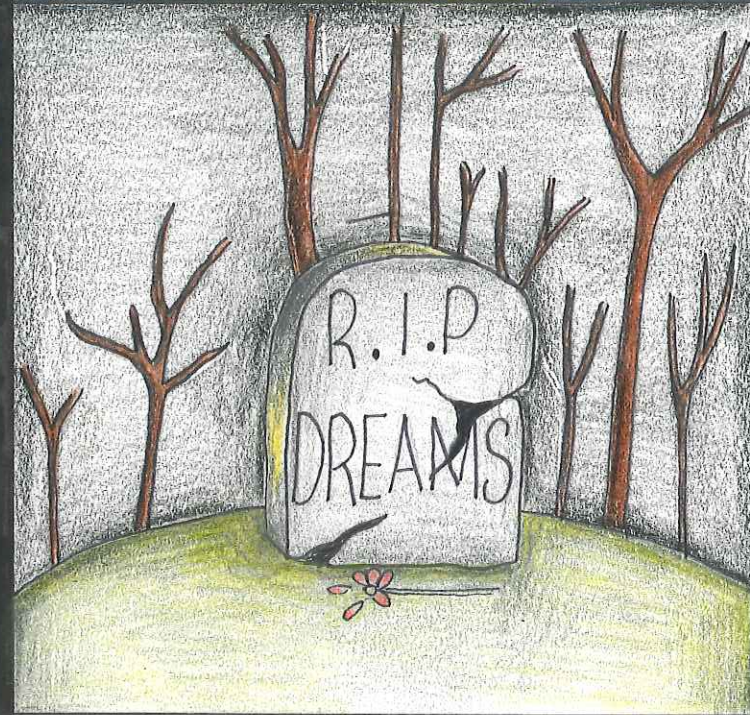
But a caged bird stands on a grave of dreams.