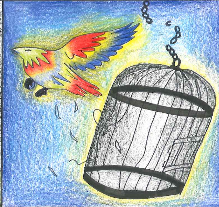
The caged bird sings of freedom.