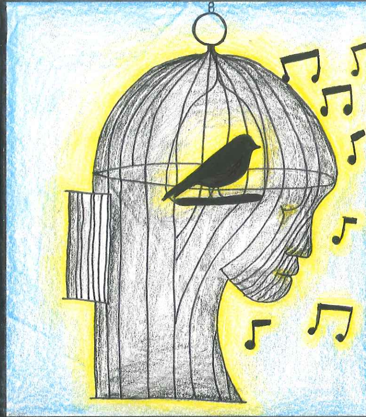
The caged bird sings a fearful trill