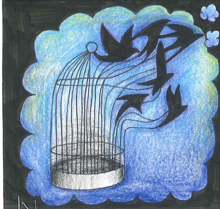
Things unknown but longed for still.